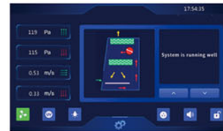
Color Touch Screen Touch operation, real-time and clearer display of various values and appointment timing function.