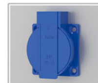
European Standard Socket