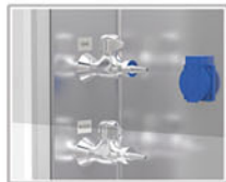
SS Water tap & Gas tap