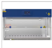
Work Zone Work zone, made of 304 stainless steel, is surrounded by negative pressure.