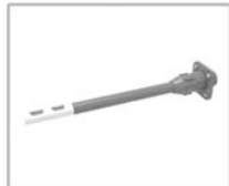
Wind Speed Sensor