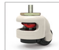
Footmaster Caster Universal caster with brake and leveling feet.